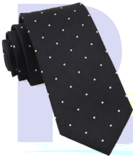
Dotted Report Black