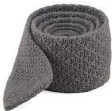
Field Solid Knit