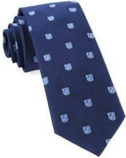
First String Crest