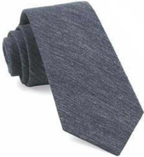
West Ridge Solid