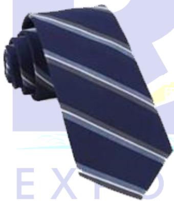
Short Cut Stripe